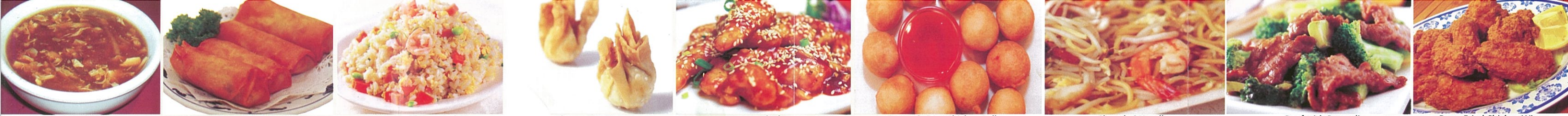
Hot and Sour Soup